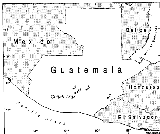
Figure 1. Location of Chitak Tzak, department of Sacatepéquez, Guatemala, and the four obsidian sources represented in the archaeological assemblage of the site (a = San Martín Jilotepeque; b = El Chayal; c = Ixtepeque; d = San Bartolomé Milpas Altas).